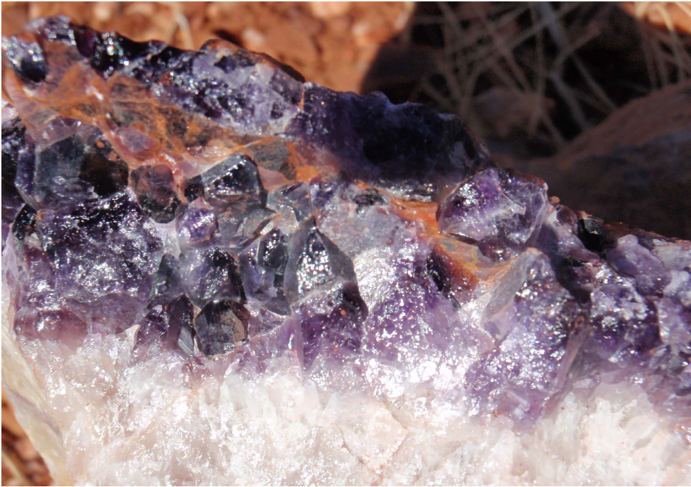
This amethyst specimen was found just lying on the ground in an area called Selwyn out from Cloncurry Qld.