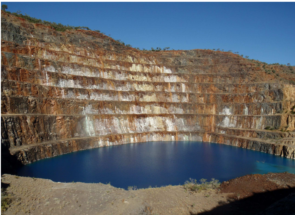
The spectacular mine pit at Mary Kathleen which is in the process of being fenced off by the Qld. Govt. and will not bae available to the general public any more.